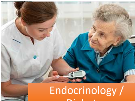
Endocrinology / Diabetes